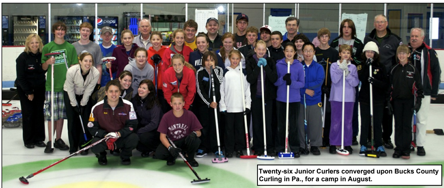
Twenty-six Junior Curlers converged upon Bucks County Curling in Pa., for a camp in August.